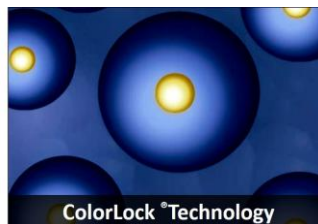
ColorLock ® Technology

In conventional paint the particles of colorants adhere loosely to the resin molecules.